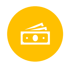
ALLOWABLE USES OF FUNDING